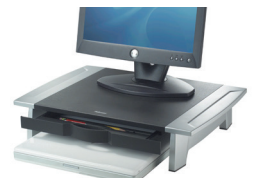
OFFICE SUITES™ Monitor Riser

Versatile design holds CRT or LCD monitor