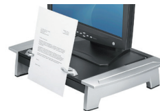
OFFICE SUITES™ Standard Monitor Riser Plus

Designed to easily sit above laptop and features convenient supplies drawer