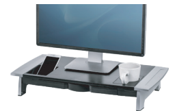
OFFICE SUITES™ Premium Monitor Riser

Platform features 3-way height and tilt adjustments for laptops