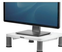
STANDARD Monitor Riser

Versatile design holds CRT or LCD monitor